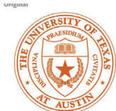
Grad made good