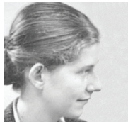
Professor receives Trefitz Award

in image data assimilation, assimilation of lightning flashes in high impact weather events and adaptive sensor location for threat detection and pollution events. He was one of the first to develop new AI-based methods in nonlinear model order reduction methods in forward and inverse problems.