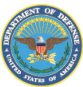
Alum receives research award